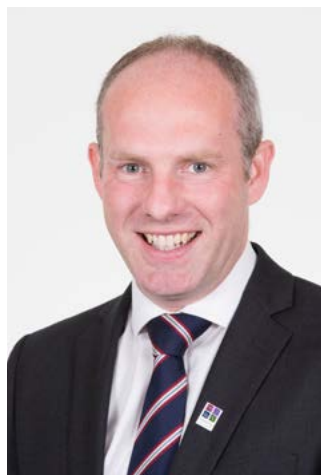
Alistair Burt Minister for Community and Social Care