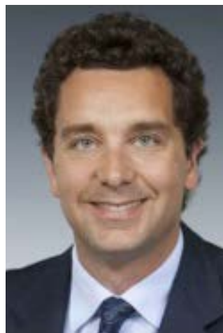
Justin Tomlinson Minister for Disabled People