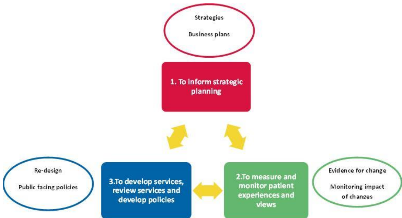
Diagram 3 Sheffield CCG's engagement cycle

patient surveys and complaints, which will then prompt a service review, and once service changes have been implemented, impacts will be monitored via seeking patient views.